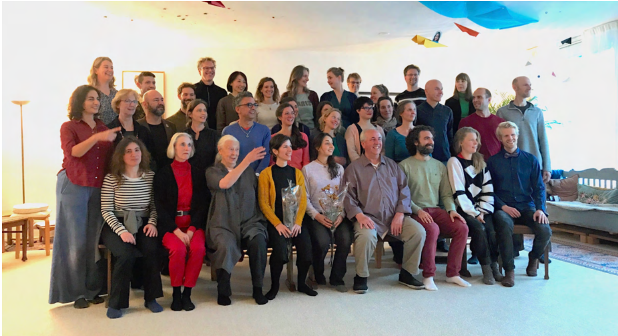
Students and teachers 2019